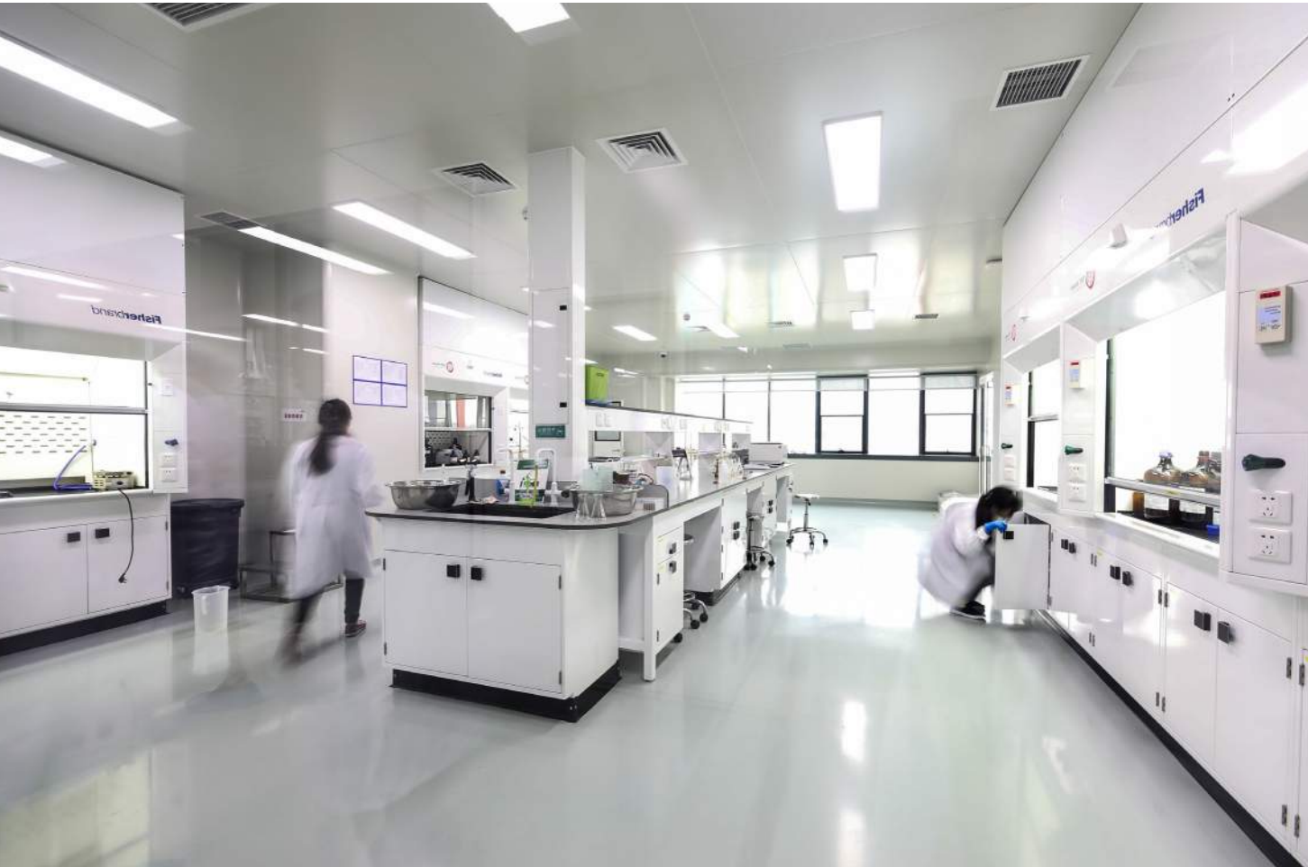
FLINDERS HEALTH AND MEDICAL RESEARCH BUILDING (HMRB) Adelaide, South Australia

The 25,000 sqm project includes wet and dry labs, an animal house and office spaces. We were required to complete a peer review to identify areas of potential improvements and inform the evolution of building services design towards an integrated approach. We focused our effort on a range of value-based initiatives that will improve the facility's overall performance, coordination, buildability, and operational outcomes.