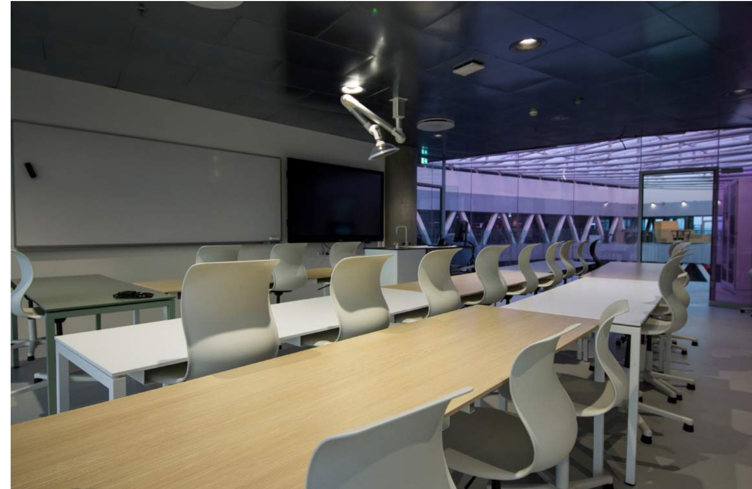
FLINDERS UNIVERSITY—NEXUS BUILDING Adelaide, South Australia

Disciplines: Mechanical, Electrical, Hydraulic, Fire Protection, ICT, Smart Buildings